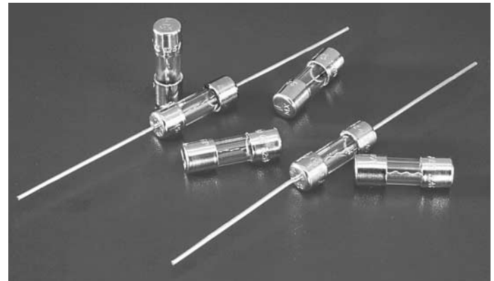
225 000 Series