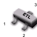
CASE 318-08, STYLE 6 SOT-23

PNP GENERAL PURPOSE DRIVER TRANSISTORS SURFACE MOUNT