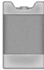
P and R Cases Image is not to scale